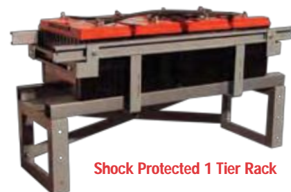
Shock Protected 1 Tier Rack