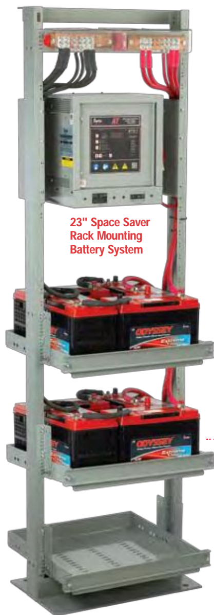
23" Space Saver Rack Mounting Battery System