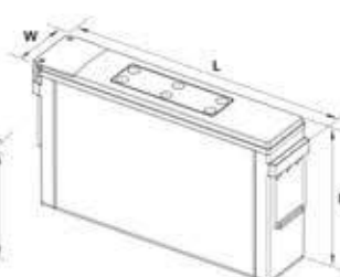
12V125F, 12V155FS, 12V170FS and 12V190F