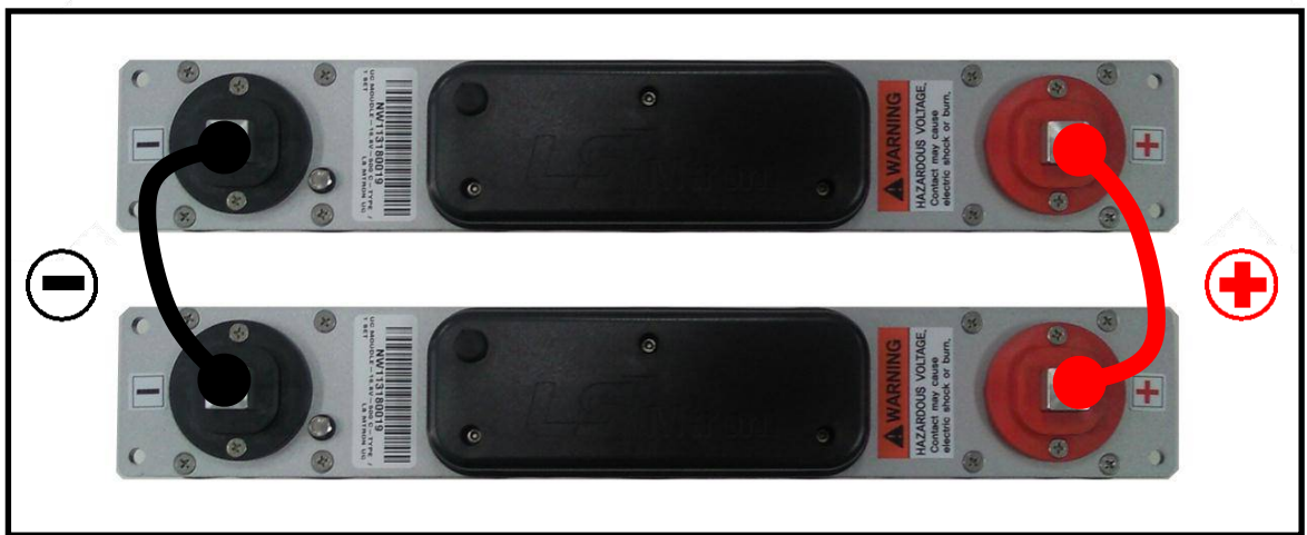
<Fig. 3> Parallel Connection of Modules