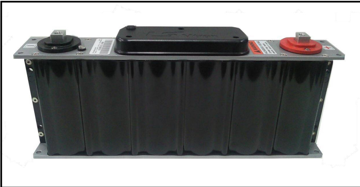
<Fig. 1> Product Image