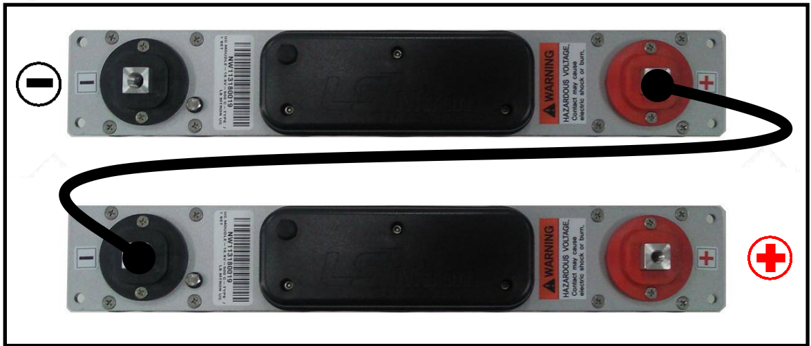
<Fig. 2> Series Connection of Modules